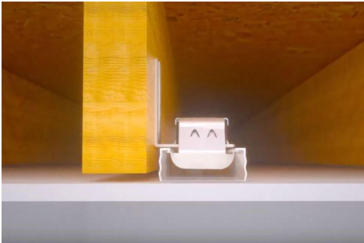
Iso-Mount Type1 achieves minimum ceiling height loss (as little as 6mm)

Building Regulations Document E sets minimum standards for soundproofing residential buildings in England and Wales. While these are great for ensuring new builds and conversions comply, the standards do not apply to existing dwellings, leaving hundreds of thousands of previously built properties with inadequate sound insulation.